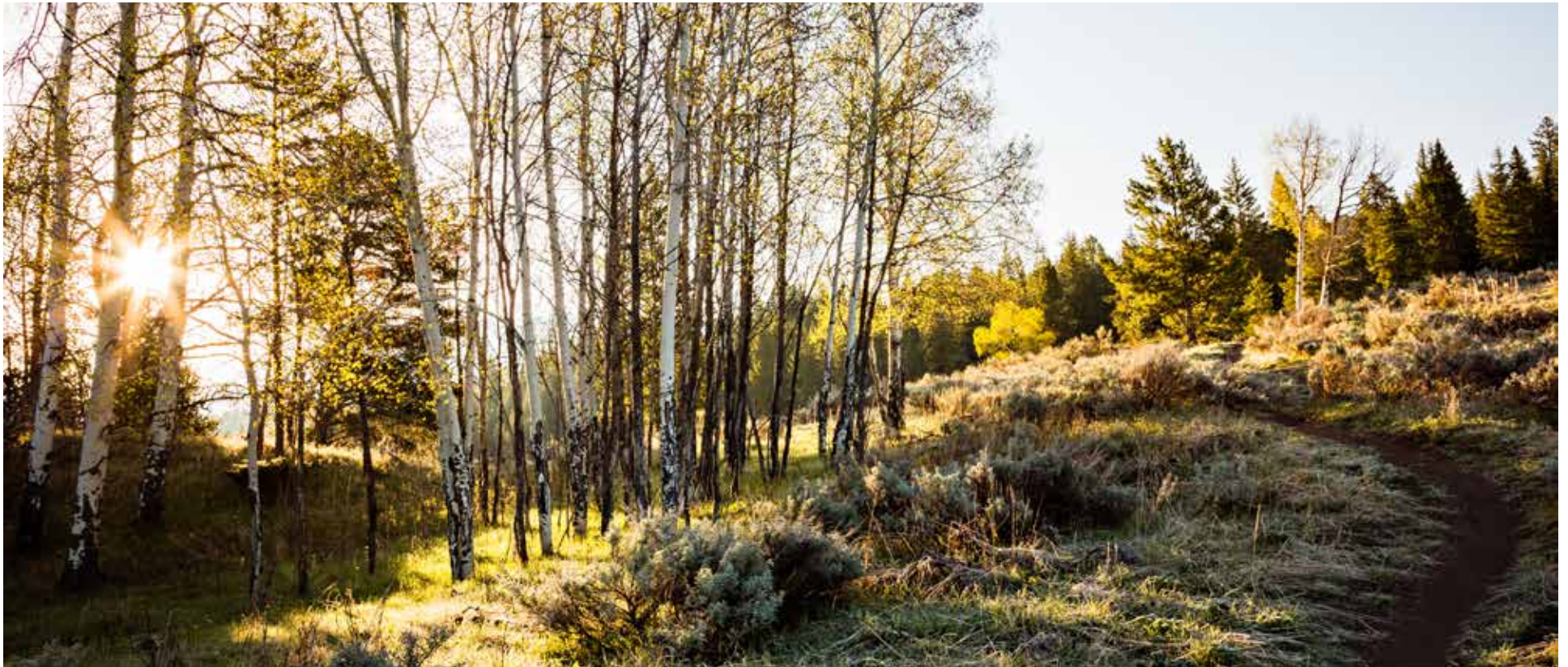
The Hummocks Trail, located less than a mile from Town Center, crosses through aspen groves and two wetlands.

Explore local hiking, biking and equestrian trails with Big Sky Community Organization's summer trail series.